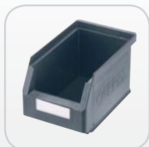
ESD - upon request