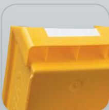
Ergonomic front handle