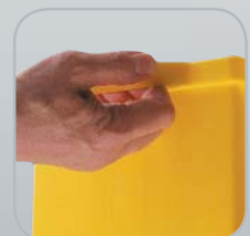
Ergonomic rear grip