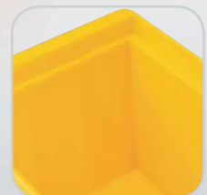
Smooth internal walls