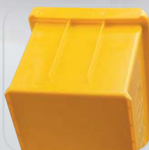
Rear hanging bar