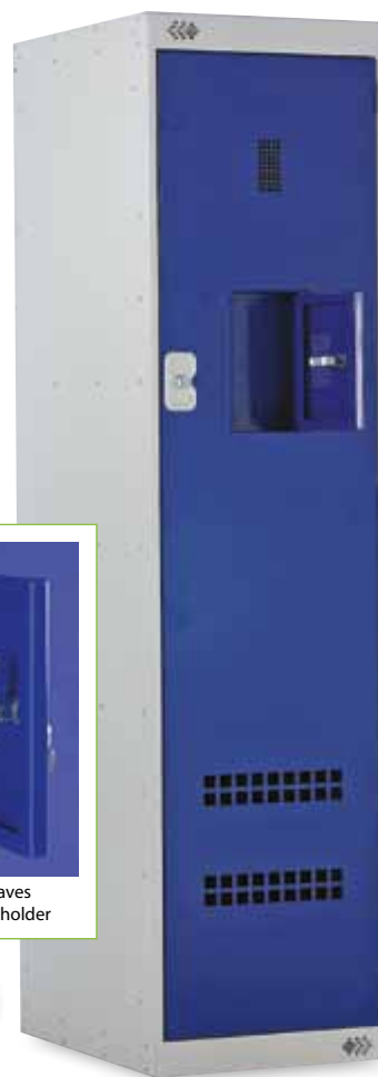
Police Locker (P3)