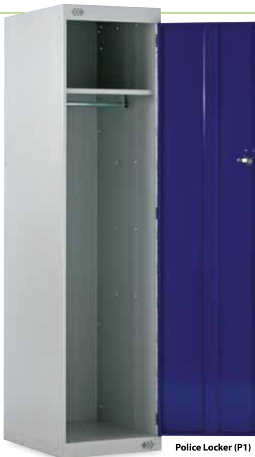
Police Locker (P1)