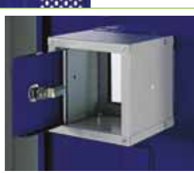
Police Locker with lockable cube