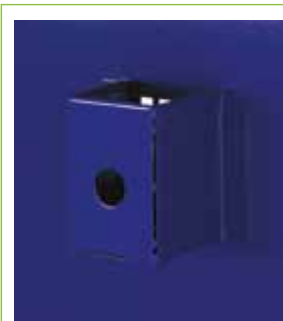
Police Locker with CS Cannister holder