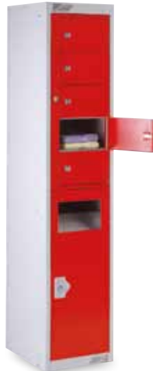
5-Tier Collector & Dispenser