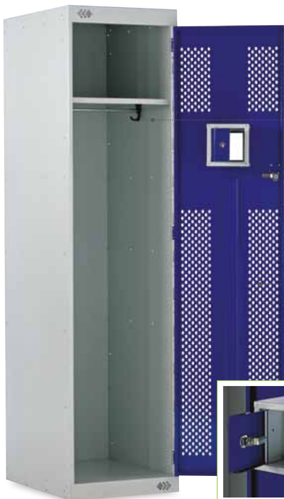
Police Locker (P2)