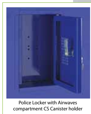
Police Locker with Airwaves compartment CS Cannister holder

Heavy duty top shelf and lower clothes hanging compartment